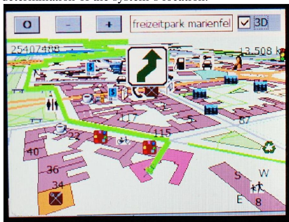
Global Positioning System

GPS is used to find the systems current position. It helps in determining the co-ordinates (longitude and latitude) of the system's position. These co-ordinates are mapped to the unit maps database which helps in determination of the system's location.