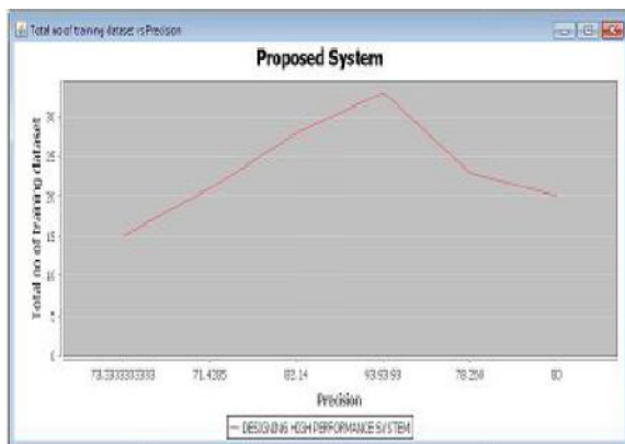
Figure 3: Performance of System